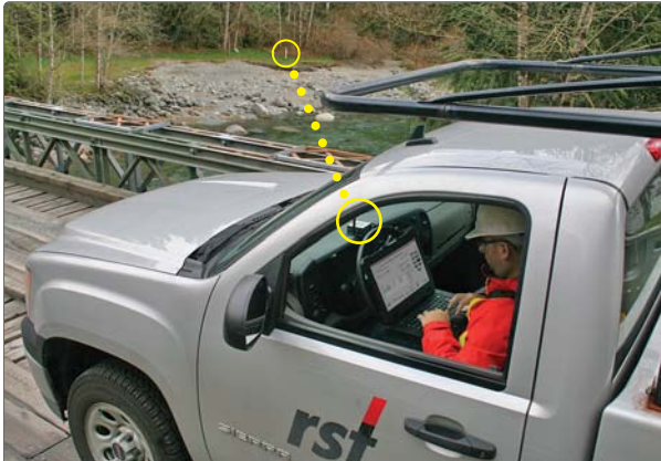
With a laptop connected to the DT LINK HUB wireless readings can be taken in seconds from DT LINK WIRELESS Data Loggers in hard to access areas - all from the convenience of your vehicle.