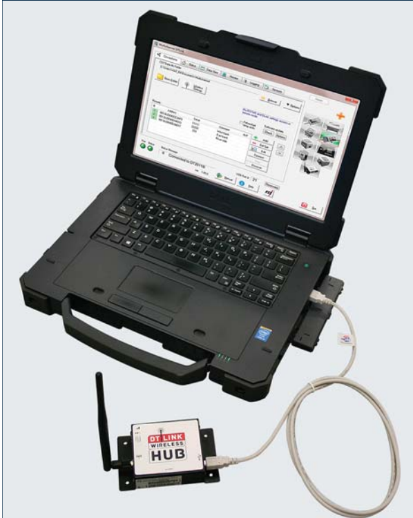
The DT LINK HUB connects to any laptop via USB and will quickly connect to a DT LINK WIRELESS Data Logger (supported devices at right). Readings can be viewed and accessed with the included host software.