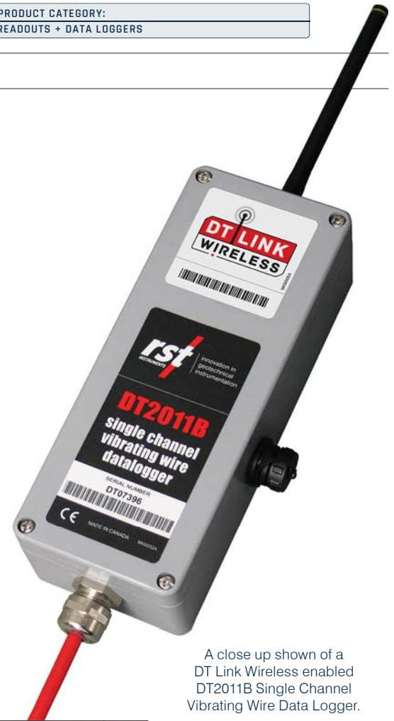
A close up shown of a DT Link Wireless enabled DT2011B Single Channel Vibrating Wire Data Logger.