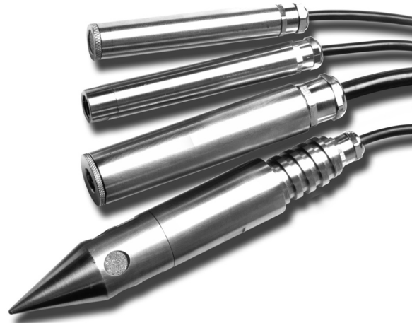
Models FOP, FOP-C, FOP-F and FOP-P

The FOP-P is designed to be driven into unconsolidated fine grain materials such as sand, silt or clay. The external housing is a thick-wall cylinder fitted with a conical shoe at one end and an EW drill rod or standpipe thread adapter at the cable entry end.