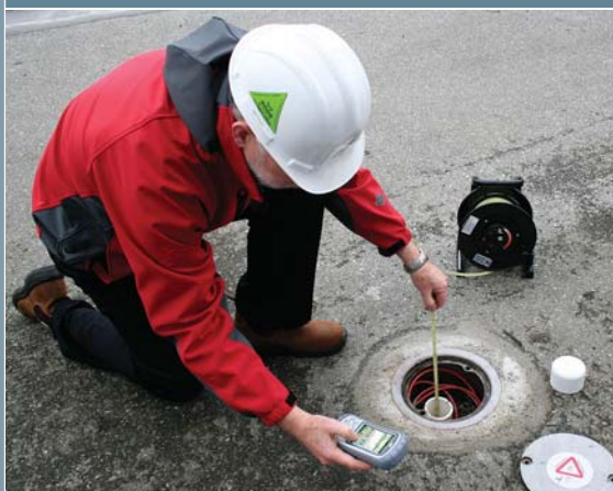
Water level readings being manually entered into FieldBook at a project site.

The Field PC 2 is a touch-screen handheld device that easily transports from site-to-site and is extremely durable in harsh elements. The large data entry buttons in the FieldBook Software are ideally suited for the Field PC 2 's touch-screen without the need for a stylus. Files are stored in a common CSV format for easy import into data display programs such as Microsoft Excel™ or RST Instruments Geoviewer. Data file templates can be set up on a PC and transferred to the Field PC 2 via ActiveSync™ connection. After collecting data in the field, data files can be transferred from Field PC 2 to office desktop PC for quick analysis.