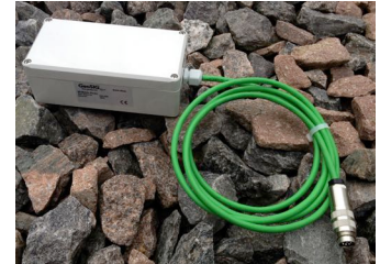
GXX-3GUE used as external modem for GMSplus