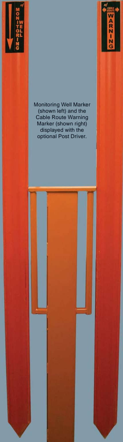
Monitoring Well Marker (shown left) and the Cable Route Warning Marker (shown right) displayed with the optional Post Driver.

Monitoring Well & Cable Route Warning Markers are the ideal way to notify and warn others about the location of monitoring wells and underground cables. They are invaluable in providing safety and greatly assist in the reduction of accidental digging and costly service interruptions.